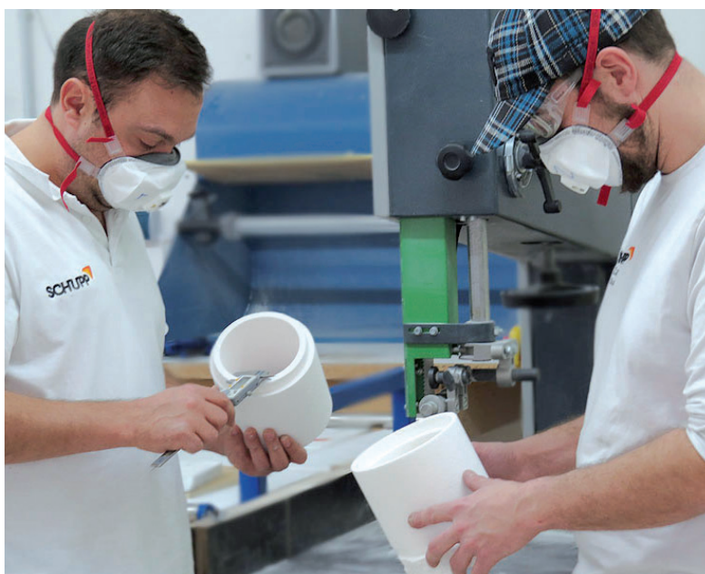
Fig. 2 Machining and quality assurance of UltraVac-formed parts