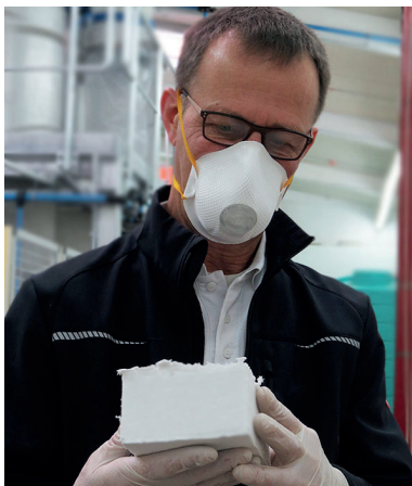
Fig. 3 New grades are continuously developed in the pilot plant

by means of pre-firing at high temperature and then machined (Fig. 2). The goal is to produce three-dimensional shaped parts in Aachen. The plant design enables the processing of various bulk wools. Individually developed recipes can be included in the range in future. A pilot plant is available for this purpose (Fig. 3).